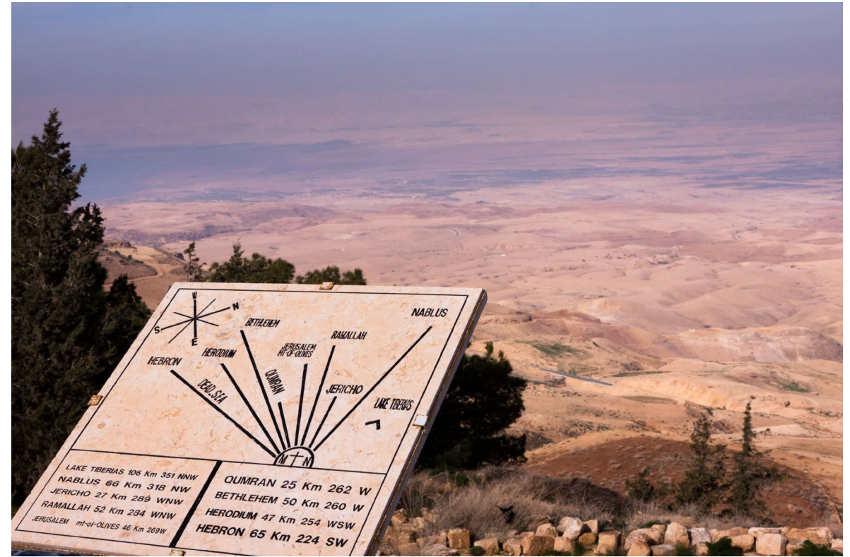
Above: Mt Pisgah/ Mt. Nebo, Jordan

Then Moses, the servant of the Lord, died there in the land of Moab, at the Lord's command. He was buried in a valley in the land of Moab, opposite Beth-peor, but no one knows his burial place to this day. Moses was one hundred twenty years old when he died; his sight was unimpaired and his vigor had not abated. The Israelites wept for Moses in the plains of Moab thirty days; then the period of mourning for Moses was ended. Joshua son of Nun was full of the spirit of wisdom, because Moses had laid his hands on him; and the Israelites obeyed him, doing as the Lord had commanded Moses. Never since has there arisen a prophet in Israel like Moses, whom the Lord knew face to face. He was unequalled for all the signs and wonders that the Lord sent him to perform in the land of Egypt, against Pharaoh and all his servants and his entire land, and for all the mighty deeds and all the terrifying displays of power that Moses performed in the sight of all Israel.