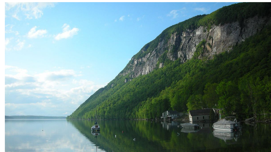
Left: Mt Pisgah, Lake Willoughby, VT