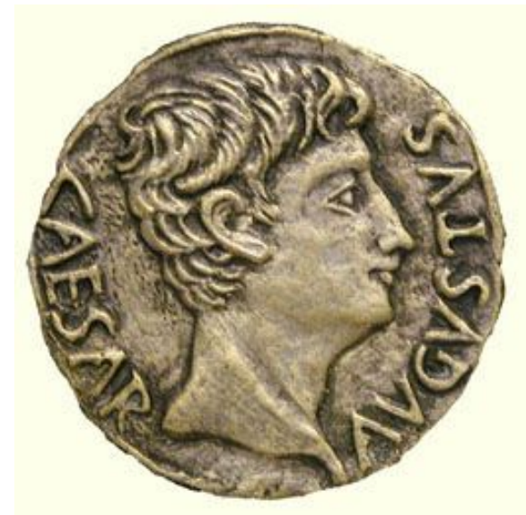
1st century Roman coin bearing the face of Emperor Augustus

The Pharisees went and plotted to entrap him in what he said. So they sent their disciples to him, along with the Herodians, saying, "Teacher, we know that you are sincere, and teach the way of God in accordance with truth, and show deference to no one; for you do not regard people with partiality. Tell us, then, what you think. Is it lawful to pay taxes to the emperor, or not?" But Jesus, aware of their malice, said, "Why are you putting me to the test, you hypocrites? Show me the coin used for the tax." And they brought him a denarius. Then he said to them, "Whose head is this, and whose title?" They answered, "The emperor's." Then he said to them, "Give therefore to the emperor the things that are the emperor's, and to God the things that are God's." When they heard this, they were amazed; and they left him and went away.