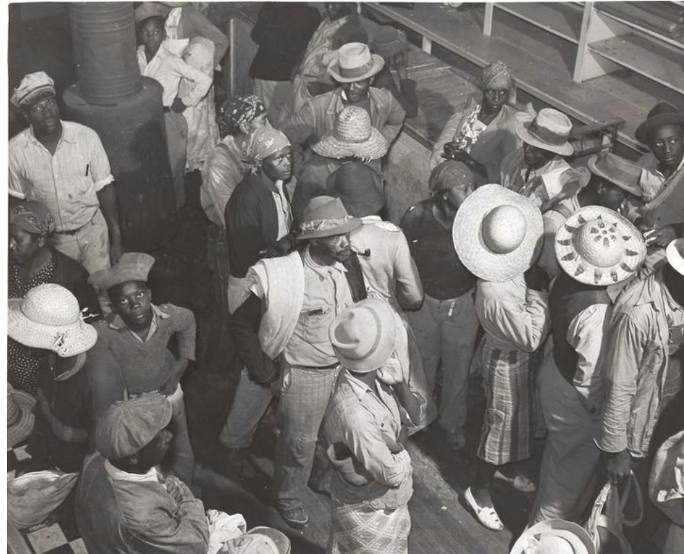
Day Laborers Brought In By Truck From Nearby Towns, 1939

When those hired about five o'clock came, each of them received the usual daily wage. Now when the first came, they thought they would receive more; but each of them also received the usual daily wage. And when they received it, they grumbled against the landowner, saying, 'These last worked only one hour, and you have made them equal to us who have borne the burden of the day and the scorching heat.' But he replied to one of them, 'Friend, I am doing you no wrong; did you not agree with me for the usual daily wage? Take what belongs to you and go; I choose to give to this last the same as I give to you. Am I not allowed to do what I choose with what belongs to me? Or are you envious because I am generous?' So the last will be first, and the first will be last."