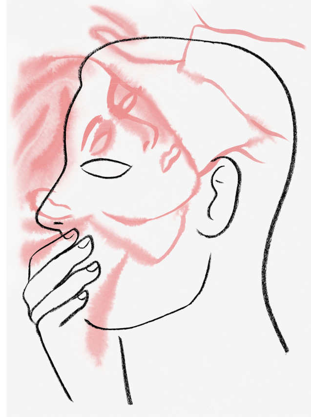
“The Confession,” by Leila Slimani (2019)

May Almighty God have mercy upon you, pardon and deliver you from all your sins, confirm and strengthen you in all goodness, and keep you in eternal life; through Jesus Christ our Lord. Amen.