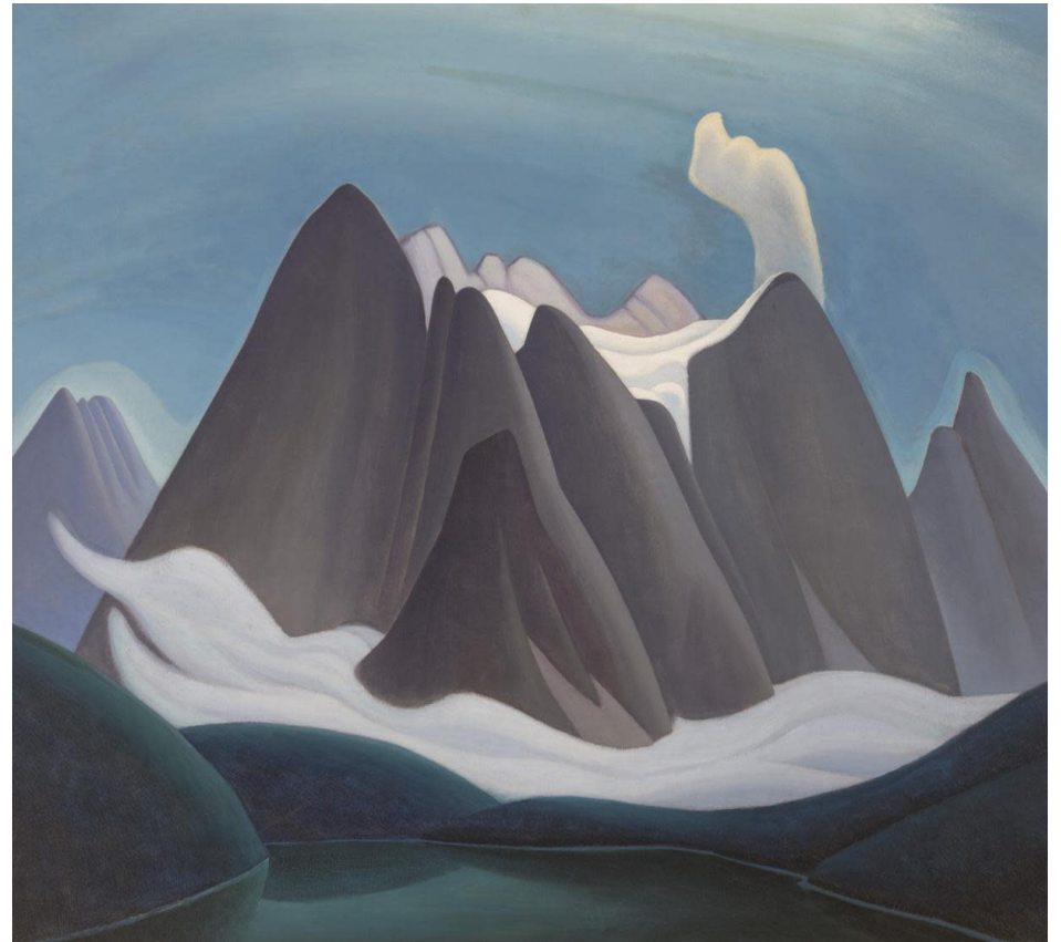
“Rocky Mountains,” by Lawren Harris (1930)

Seek the Lord while he wills to be found; call upon him when he draws near. Let the wicked forsake their ways and the evil ones their thoughts; And let them turn to the Lord, and he will have compassion, and to our God, for he will richly pardon. For my thoughts are not your thoughts, nor your ways my ways, says the Lord. For as the heavens are higher than the earth, so are my ways higher than your ways, and my thoughts than your thoughts. For as rain and snow fall from the heavens and return not again, but water the earth, Bringing forth life and giving growth, seed for sowing and bread for eating, So is my word that goes forth from my mouth; it will not return to me empty; But it will accomplish that which I have purposed, and prosper in that for which I sent it.