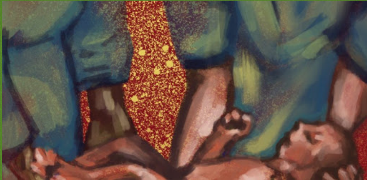
Shiphrah and Puah

Our Father, who art in heaven, hallowed be thy name, thy kingdom come, thy will be done, on earth as it is in heaven. Give us this day our daily bread. And forgive us our trespasses, as we forgive them who trespass against us. And lead us not into temptation, but deliver us from evil. For thine is the kingdom, the power, and the glory, for ever and ever. Amen.