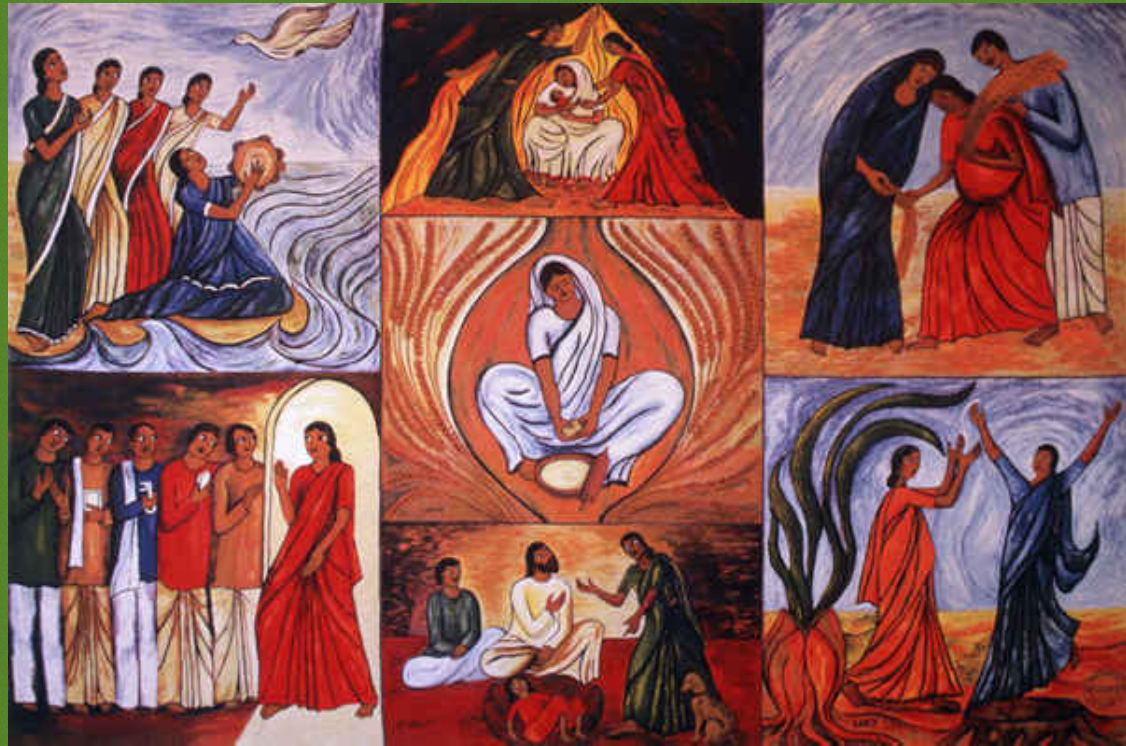
"The Leigh Russell Memorial Panel" - Lucy d'Souza