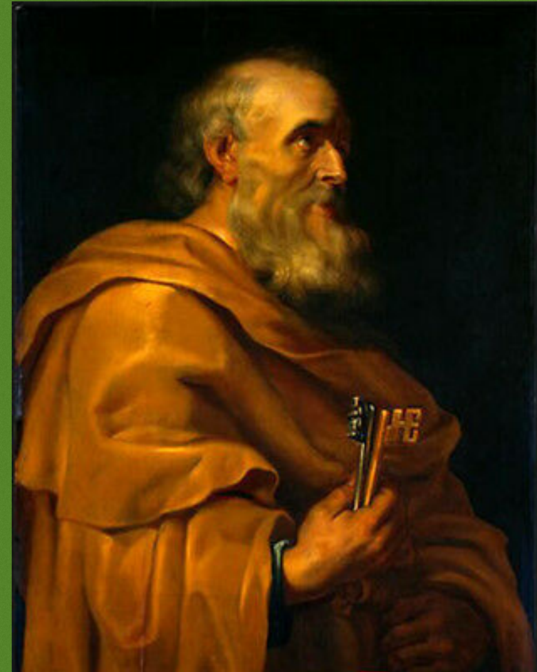
"Elder portrait: Saint Peter" - Peter Paul Rubens

We believe in God the Spirit; in one Church, below, above: Saints of God in one communion, one in holiness and love. So by faith, our sins forgiven, Christ our Saviour, Lord, and friend, we shall rise with him in glory to the life that knows no end.