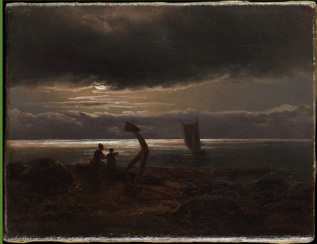
"Mother and Child by the Sea" - Johan Christian Dahl

In steadfast love you led your people, you guided your redeemed with your great strength. You brought them in safety to your holy place, and planted them firm on your own mountain. You brought them into your own house. The Lord shall reign for ever and ever.